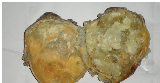
[Table/Fig-2]: Right kidney bisected to show renal tissue compressed at upper pole by pseudotumoral hydatid cyst